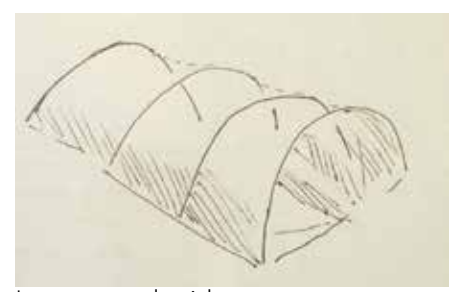
Low tunnel with row cover

The big disadvantage of the rigid cold frame covers or polyethylene is that they do not vent to keep heat from building up during sunny days, possibly cooking your vegetables prematurely. For tunnels, you will need to be able to roll up at least one side to vent the structure on any sunny day warmer than about 45F. There are automatic openers available for cold frames. Although that adds expense, it makes them practical