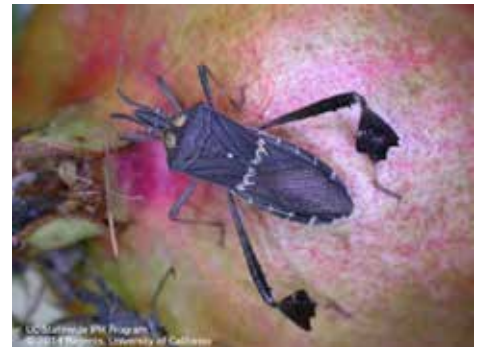
Leaffooted bug adult