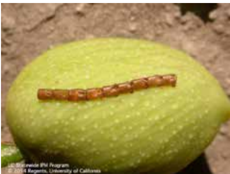
Leaffooted bug eggs are laid end to end in strands

http://ucce.ucdavis.edu/files/datastore/391-534.pdf