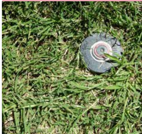
Bermuda grass in lawn clippings can easily survive the composting process.

Be certain of your composting success by avoiding weed seeds or other reproducing parts in your compost pile, period.