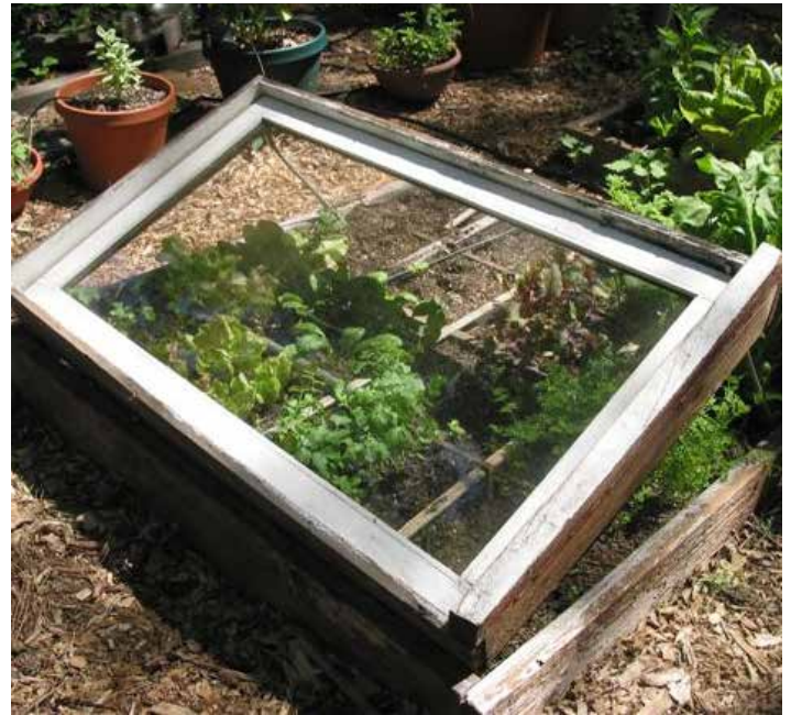
Repurposed old windows make great coldframe covers.

Row cover fabric can be found in most local nurseries or in the garden departments of big box or variety stores. It can also be ordered from most internet seed and garden-