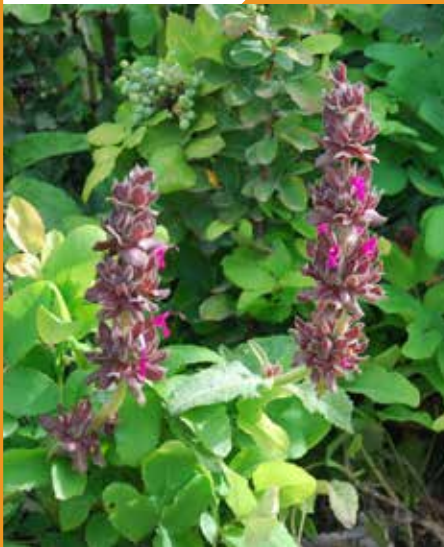
at the UC Davis Arboretum

Every time someone breaks something at my house I think to myself "self, how can I use this in the greenhouse or garden?"