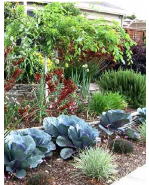
Cabbage and onions are attractive additions to this ornamental landscape.