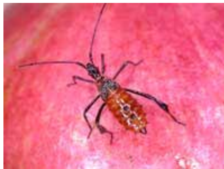
Leaffooted bug nymph