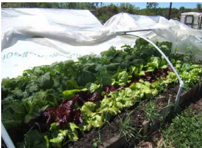
Row covers can be pulled back or removed during warm days to allow more light to reach the plants.